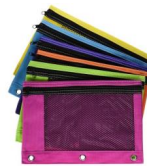
Zippered School Supply Pouch

Order your school supply pack from EPI using code HAR416 . Save time, money and avoid crowds by purchasing packs for ONLY $100 . Packs will be shipped to school and will be available for pick up during Meet the Teacher on August 7 from 1:30-4:00 . Packs include all required supplies EXCEPT Backpack (K-2nd Grades-no wheels) or Caselt Binder with shoulder strap (3rd-6th Grades) and Headphones (All Grades-no earbuds). Place your order NOW-JUNE 15 . Visit the link: www.educationalproducts.com/shoppacks