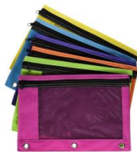
Zippered School Supply Pouch

Order your school supply pack from EPI using code HAR416 . Save time, money and avoid crowds by purchasing packs for ONLY $100 . Packs will be shipped to school and will be available for pick up during Meet the Teacher on August 7 from 1:30-4:00 . Packs include all required supplies EXCEPT Backpack (K-2nd Grades-no wheels) or CaseIt Binder with shoulder strap (3rd-6th Grades) and Headphones (All Grades-no earbuds). Place your order NOW-JUNE 15 . Visit the link: www.educationalproducts.com/shoppacks