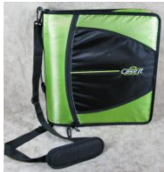
Zippered Binder w/strap

***** NO Backpack- instead Large Zippered Binder w/ Shoulder Strap *****