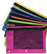
Zippered School Supply Pouch

Order your school supply pack from EPI using code HAR416 . Save time, money and avoid crowds by purchasing packs for ONLY $100 . Packs will be shipped to school and will be available for pick up during Meet the Teacher on August 7 from 1:30-4:00 . Packs include all required supplies EXCEPT Backpack (K-2nd Grades-no wheels) or CaseIt Binder with shoulder strap (3rd-6th Grades) and Headphones (All Grades-no earbuds). Place your order NOW-JUNE 15 . Visit the link: www.educationalproducts.com/shoppacks