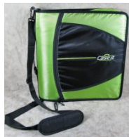
Zippered Binder w/strap

*****NO Backpack- instead Large Zippered Binder w/ Shoulder Strap*****